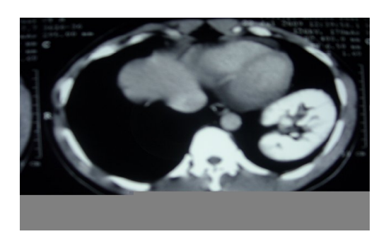
Figure 3 Axial CT scan showing a left thoracic kidney

The left ureter exited the hemi-thorax through diaphragm. The left renal arteries arose from the normal level and extended into the hemi-thorax where the kidney was located. The suprarenal gland was also at its normal location.