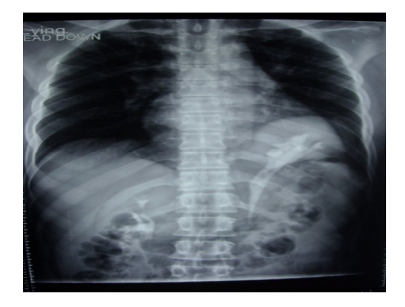
Figure 1 IVU with thoracic kidney

A 38 year old man was referred from a polyclinic in Accra to the Department of Radiology, Korle Bu Teaching Hospital for an intravenous urogram (IVU) to assess the function of his right kidney. This was because he had had an abdominal ultrasound scan done earlier for abdominal pain which said his right kidney was small. No mention was made of the left kidney in the request. The patient did not have any history of trauma or surgery. The IVU showed a normal right kidney with adequate function. The left kidney was seen in the left thoracic cavity. The calyces of the left kidney were full, the pelvis was normal and the ureter was elongated but inserted orthotopically in the bladder. The ureter exited the thorax through the diaphragm (Figure 1).